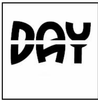
Wuzzle No. 2