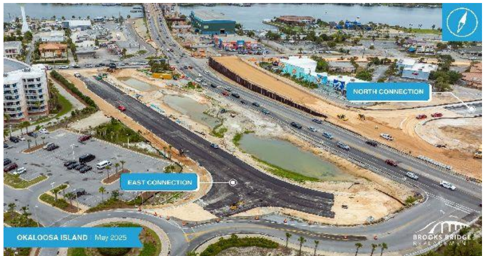
Photo of Progress of Bridge Construction (U.S 98 Westbound Approach) Taken in May 2025

The project spans from Eglin Parkway to Pier Road and is expected to be completed by summer 2027.