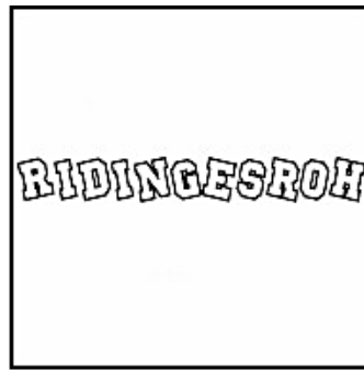
Wuzzle No. 3